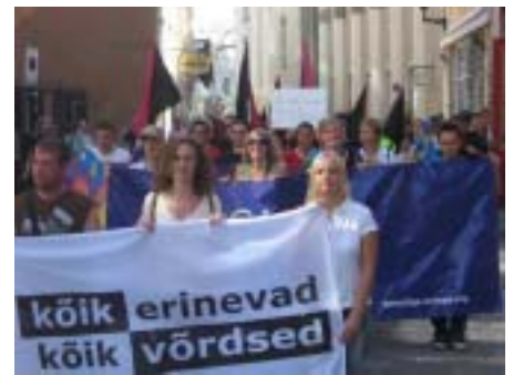
Tallinn Pride 2007

Aside manning an information booth and stage presentations at the fair, the Nordic Rainbow Council is also organizing a series of seminars at the near-by Museum of World Culture in this west coast Swedish port city to put a spotlight on the gains made by activists and Pride organizers in the Baltic region – and the continued refusal of the authorities to remove the ban on public rainbow demonstrations in Vilnius – despite Lithuania's membership in the (continued on page 4)